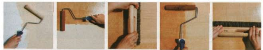
STEP 1. Roll on two coats of base coat and let dry.