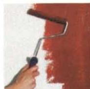
STEP 1. Roll on two coats of base coat and let dry.