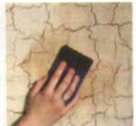
STEP 4. Rub damp sponge into Antique Wax to create depth.

Crackle in a vertical fashion. Let dry one hour and apply a second coat. Let second coat dry 2 hours.