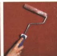
STEP 2. Roll on a coat of Base Crackle in a vertical fashion.